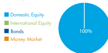
PCA Large Cap Value Fund

Inception 12/29/2009 Total Net Assets $16,851,984 Trustee and Plan Administrator: PCA Retirement & Benefits, Inc. 1700 North Brown Road • Suite 106 Lawrenceville, Georgia 30043